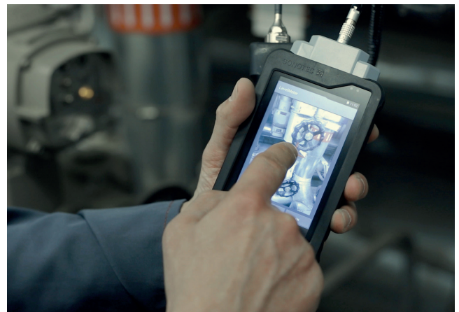
After the temperature is taken and the ultrasound is recorded, photos, voice memos and comments on each test point can be added.

changed the first traps.’ In the future, all of the steam traps in Peniger’s factory will be recorded and tested on a regular basis. The scheduled preventive maintenance will include monitoring the condition of the traps every six months. Moreover, the team also plans to use the SONAPHONE for other maintenance tasks. For example, they can use the digital testing device to detect leakages in the compressed air