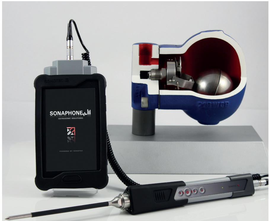
When testing the steam trap, the energy scouts used technology from the company SONOTEC to assist them. Is the steam trap working correctly or is it defective? The digital ultrasonic testing device SONAPHONE delivered the answer to this question.

A section with 28 thermal and float condensate drains were supposed to be analysed. All of the steam traps in the