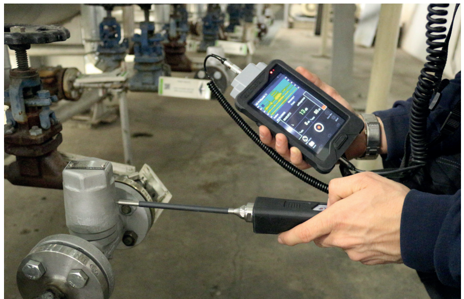
Recording the ultrasonic signal at a frequency range of 20 to 100 kilohertz with a broadband structure-borne sound sensor. The characteristic sound changes of defective steam traps can be distinguished immediately from the characteristic sounds of intact traps.

can be distinguished immediately from the characteristic sounds of intact traps.