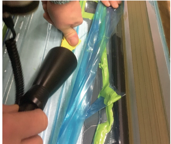
Figure 2: Sealing a leak after precise localization

Directional Tube with tip: Shields against other ultrasound sources and enables exact localization of the leak