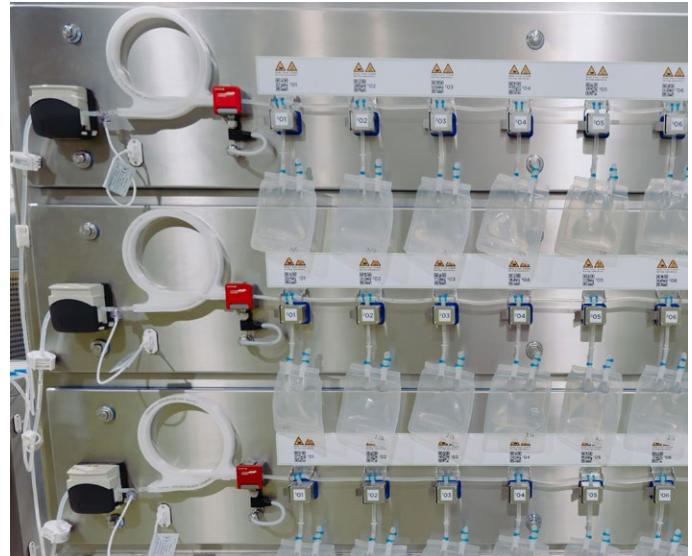
RoSS.FILL CGT

importance of flexibility. If bag sizes or batch volumes vary due to scale-up or scale-down requirements, the filling system must do so accordingly. The modular RoSS.FILL platform can be adapted to the customer's needs: increase or lower the batch volume or bag size per rack. The highly accurate SONOFLOW CO.55 V3.0 flow sensor ensures the configured filling volume in the single-use bags or bioprocessing containers.